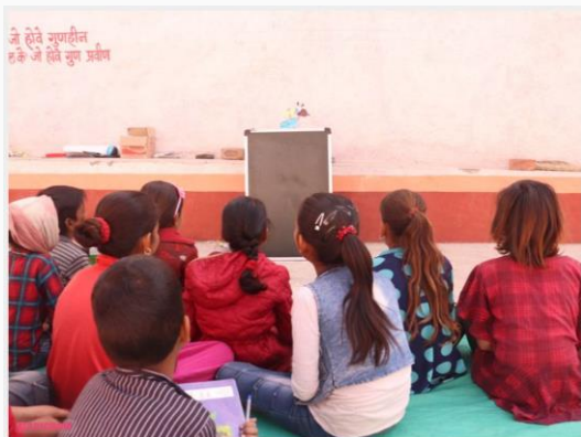
EXPLORING THE IDEA OF TOUCH