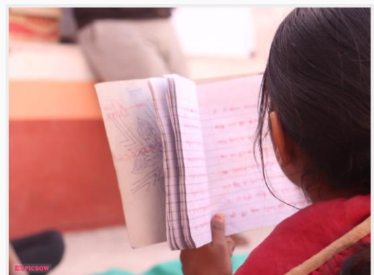
A WISH TO OVERCOME HURDLES